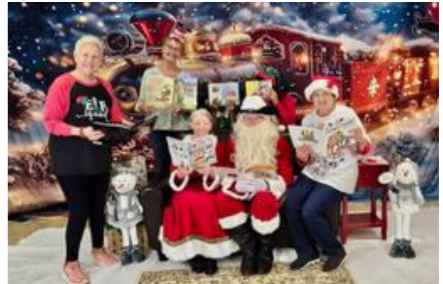
HARTA Breakfast with Santa Book giveaway.