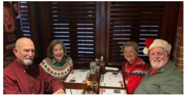
Dinner at Barnaby's Café.