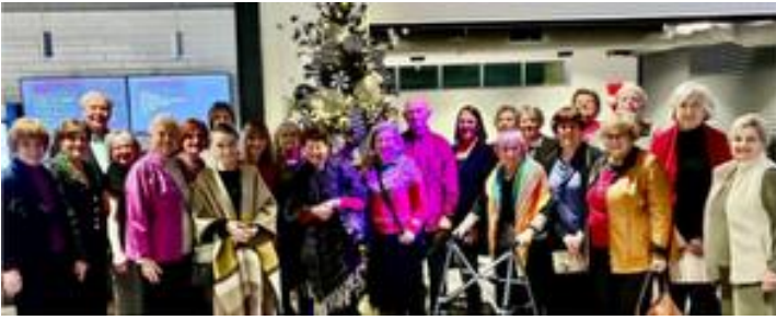
It's a Wonderful Life at Stages Theater.